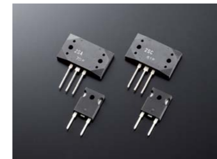
Large output transistor / Schottky barrier diode (Current amplification stage)

We have gone to extremes to use the highest quality components to maintain signal clarity and minimize transmission loss. For connection terminals, the amplifier uses the XLR input terminal---which is highly reliable and provides excellent contact---along with ESOTERIC's original RCA input terminal. In addition, the WBT nextgen; WBT-0710Cu speaker terminals have conductor cores of pure copper with gold plating to achieve high conductivity and low resistance. On top of this, we have used ultra high grade components such as an electrolytic capacitor and a high frequency/low impedance transistor. These components were selected based on property examination and trial listening. It is an Esoteric requirement that all critical components undergo exhaustive listening tests before any final section is made.