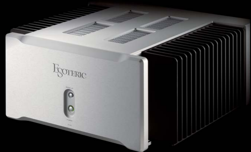
CLASS A STEREO POWER AMPLIFIER A-03