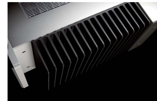
Large heat sink finished in black alumite

This function enables the device to be warmed up to play audio, while reducing electric power consumption (As compared to normal operation). At warm-up mode: power consumption of 220 watts (a reduction of about 45%) is achieved.