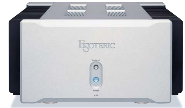
CLASS A STEREO POWER AMPLIFIER A-03